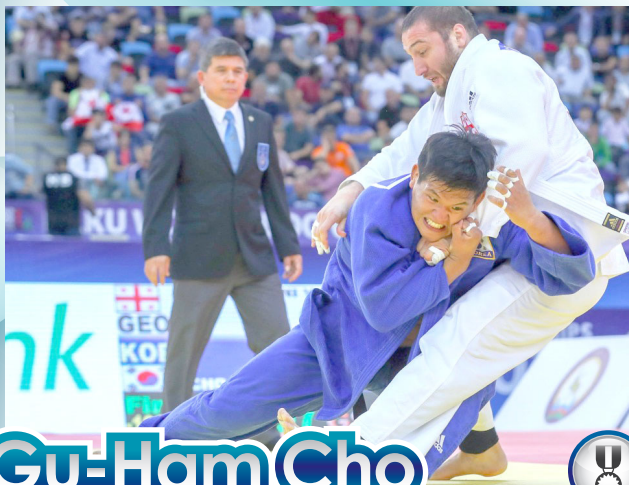
Gu-Ham Cho KOR-100kg

OLYMPIC CHAMPION 2016 WORLD CHAMPION 2013-2014 EUROPEAN CHAMPION 2013-2014-2017